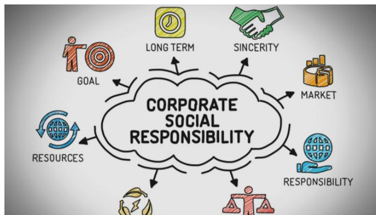
Figure 1: Corporate Social Responsibility

have utilized their power to push it past individual or even industry-wide activities. While it has been viewed as a type of corporate self-guideline for quite a while, in the course of the most recent decade or so it has moved significantly from intentional choices at the degree of individual associations, to obligatory plans at provincial, national and global levels.