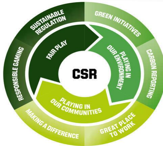
Figure 2: Types of corporate responsibility