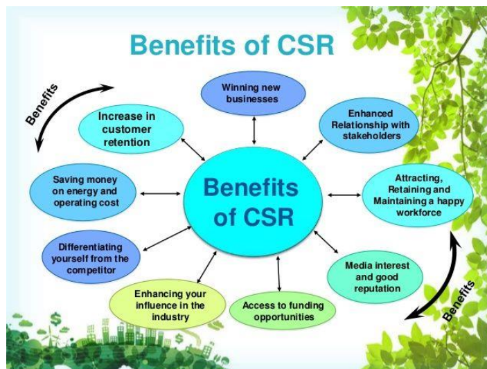
Figure 3: Corporate social responsibilities benefits