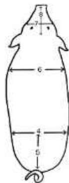
Figure 3: Measurement methods of hip width (4), rump length (5), chest width (6), head width (7) and head length (8).

7. Head length (cm) was obtained by measuring the distance from inion to nasion with a measuring tape (Figure 3).