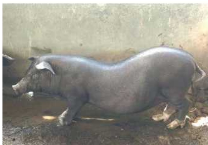
Figure 1: Adult male Bali pig.

Bali pigs are germplasm that needs to be saved in order to prevent extinction due to their limited population. They are genetically slower to grow compared to imported breed pigs. Furthermore, there are two species of Bali pigs, namely those found in the eastern region which is believed to have originated from China ( Sus vittatus ). They have a bit rough black fur, a long snout, and a curved back but their stomach does not touch the ground. Meanwhile, the species that live in northern, western, central, and southern Bali have the characteristics of a downward curved back (lordosis), a large stomach, white stripes on the abdomen and legs, short muzzle, erect ears, adult pig body height of about 54cm, body length of about 90cm and tail length between 20-25cm (Figure 1). The mother pig ( bangkung ) has a very low belly that can even touch the ground when it's standing. It has nipples between 12-14 and can give birth to 12 tails at a time. In addition, the species is better known as the Bali Bali (Sihombing, 2006).