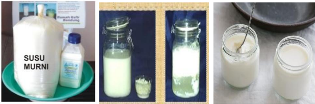
Figure 1. Tools and Materials for Making Kefir Starters.

The flowchart makes a kefir starter (Figure 2).