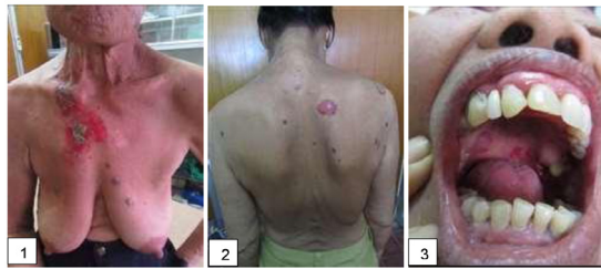
Figure 1-3 Clinical manifestation in the chest and back showed multiple flaccid bullae containing serous fluid with multiple erosions and positive Nikolsky sign (1 and 2); Clinical manifestation in oral mucous showed multiple erosion (3)