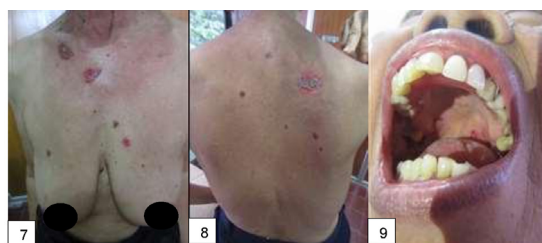
Figure 7-9 Clinical manifestation in the chest, back, and oral mucous after one month of treatment

finding revealed suprabasal blister with acantholytic cells with inflammatory infiltrate containing polymorphonuclear cells, neutrophils, plasma cells, and lymphocytes that were appropriate with PV (Figure 5-6).