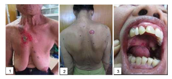
Figure 1-3 Clinical manifestation in the chest and back showed multiple flaccid bullae containing serous fluid with multiple erosions and positive Nikolsky sign (1 and 2); Clinical manifestation in oral mucous showed multiple erosion (3)