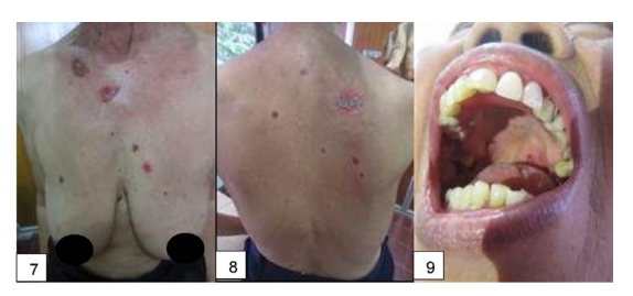
Figure 7-9 Clinical manifestation in the chest, back, and oral mucous after one month of treatment

Figure 5-6 The histopathologic finding revealed suprabasal blister with acantholytic cells with inflammatory infiltrate containing polymorphonuclears cells, neutrophils, plasma cells, and lymphocytes that is appropriate with PV