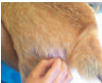
Figure 2a. Trichogram techniques