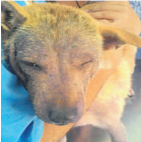
Figure 1a. Dog samples with hair loss symptoms in the face and leg areas