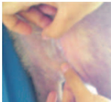
Figure 2b. Taping techniques