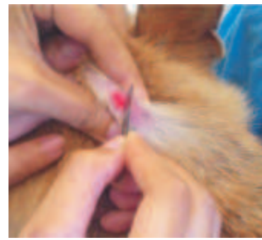
Figure 2c. Scraping techniques