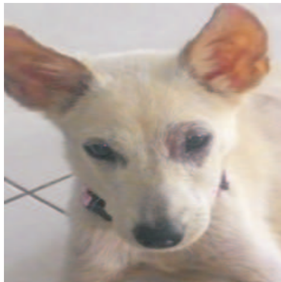
Figure 1b. Dog samples with hair loss symptoms around the eyes