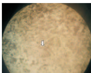
Figure 3b. Result of Demodex mites isolation on taping technique, under light microscope with 400x magnification.