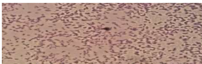
Fig 1: Gram staining LAB SR2 isolates

The results of cultivation of SR2 LAB isolates were conducted by growing isolates in MRS broth media in an anaerobic atmosphere, and showed the lush growth of bacteria which indicate that the optimal bacteria grow in anaerobic atmosphere as well as the characteristics of LAB bacteria. SR2 isolate staining results showed the shape like a short trunk (cocci) in purple that can be seen in Fig. 1.