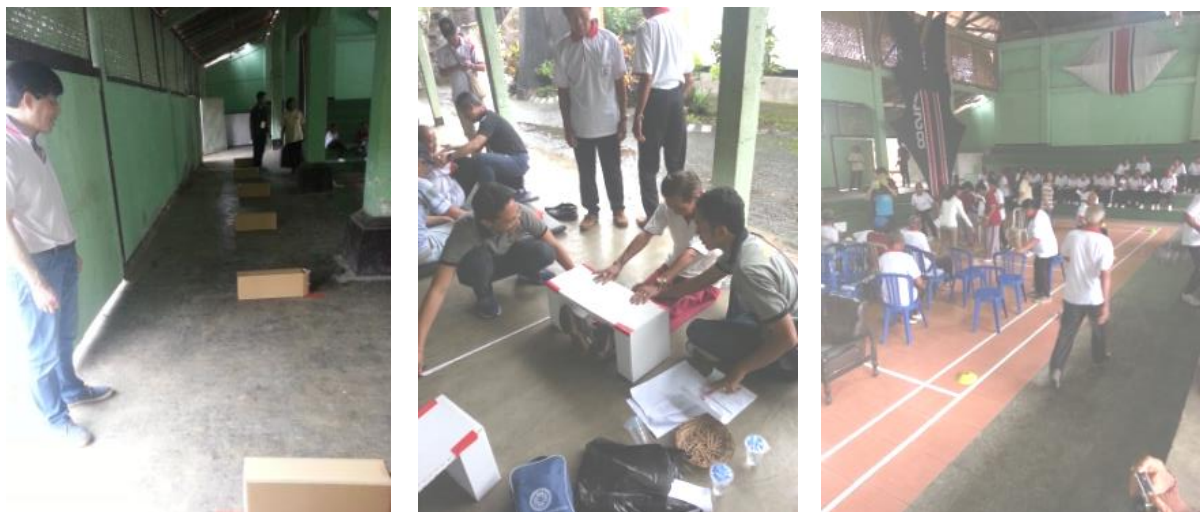
Fig. 2: Physical fitness test using a 10 m obstacle walk (left), sit-reach test (middle) and 6-min walk (right)