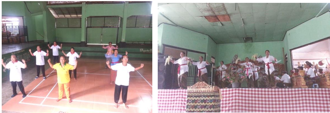
Fig. 1: Physical activity through exercise (left) and Balinese dance (right)

A total of 60 people aged 67.9 \pm 1.2 y were recruited from Tabanan, Indonesia, and a total of 72 people aged 67.3 \pm 0.6 y were recruited from Denpasar, Indonesia. Both groups received health education consisting of physical education every week, such as exercise, fun walking 5 km, and social activities based on Balinese culture, including dancing and singing (fig. 1). The health program lasted 8 mo, and everyone was equipped with a pedometer. Before and after the program, their energy expenditure was measured using a pedometer, anthropometric measurements were obtained, go/no-go tasks were used for the brain function assessment, and physical fitness tests and blood chemistry tests were performed (fig. 2).