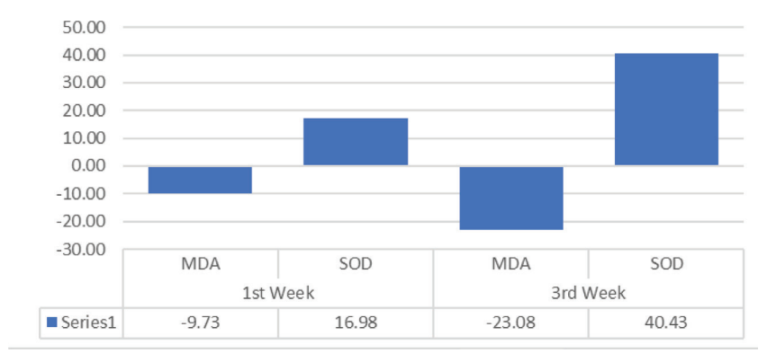
Figure 3 Change in MDA and SOD level before and after exercise in 1 and 3<sup>rd</sup> week (%)

SOD were different significantly, then we evaluate the depression of MDA level and elevation of SOD