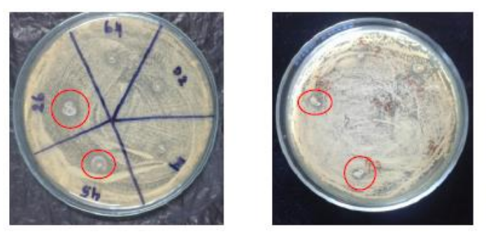
Figure 1: In vitro inhibition zones produced by LAB isolates on C. albicans