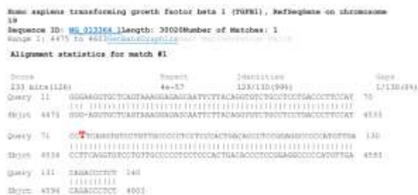
Figure 3 Representative of BLAST Result for one sample

Eligible samples were processed by PCR and then electrophoresed. The analysis was continued with the BLAST program to match the base sequence of the TGF-B1 rs1800469 gene polymorphism which had been sequenced according to the base sequence listed in the BLAST program (Figure 3). The Snapgene application is used to read the sequencing results (Figure 4).