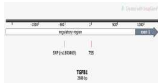
Figure 1 TGF-B1 rs1800469 gene (7)

Cancer is a multifactorial, multigenetic and multistage disease because of the complex interaction of environmental and genetic factors. Cancer heritability is related to gene defects and genetic variations in DNA sequences. SNPs are a common cause of human genetic variation (10) . TGF-B1 rs1800469 gene polymorphism as one of the high quality SNPs that has a significant relationship to sporadic CRC in the Asian subgroup (2) .